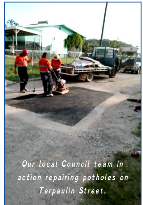
Our local Council team in action repairing potholes on Tarpaulin Street.

Each site will be blocked off for access as much as possible while limiting impact on community members, traffic flows and the primary users of the assets. Thank you all for your support while we deliver these important asset upgrades for community.